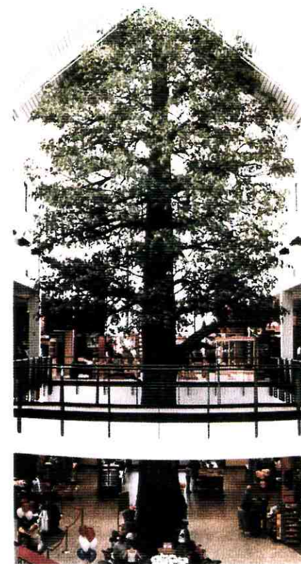
The decorative trees in the Scheels All Sport stores are more than six-stories tall and create a sense of awe within the store environment.