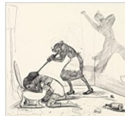
Kara Walker's Most Powerful Images Yet