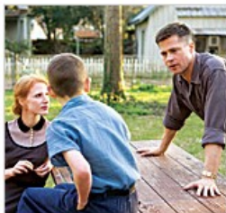
Movie Reviews: The Tree of Life , Pirates