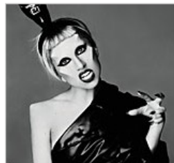
The Flimsy Fury of Lady Gaga's Born This Way