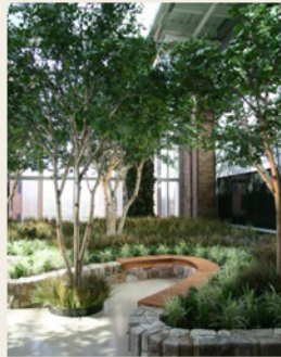
St. Joseph Mercy Hospital. Six Birch Trees for the North Tower meditation garden. >learn more