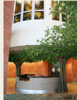
Cardon Children's Medical Center. Two 16' fig trees. Designed around reception desk. >learn more