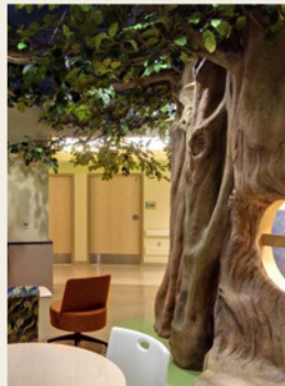
Tucson Medical Center. 11' tall Fig tree with walk through trunk. >learn more