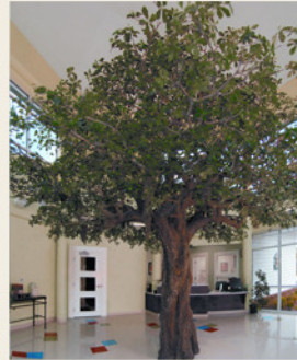
Phoebe Putney Memorial Hospital. 17' tall Oak Tree in waiting area. >learn more