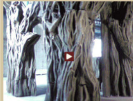
Golisano Children's Museum