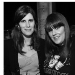
PARTIES Happy Anniversary