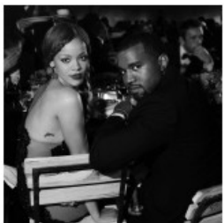
PARTIES The Costume Institute Gala