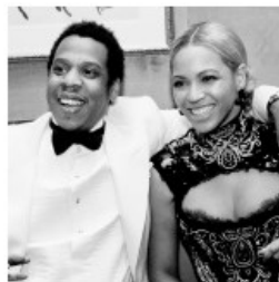
PARTIES Crowning Glory: The Met Gala After-Party