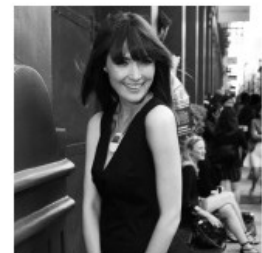
PARTIES Block Party